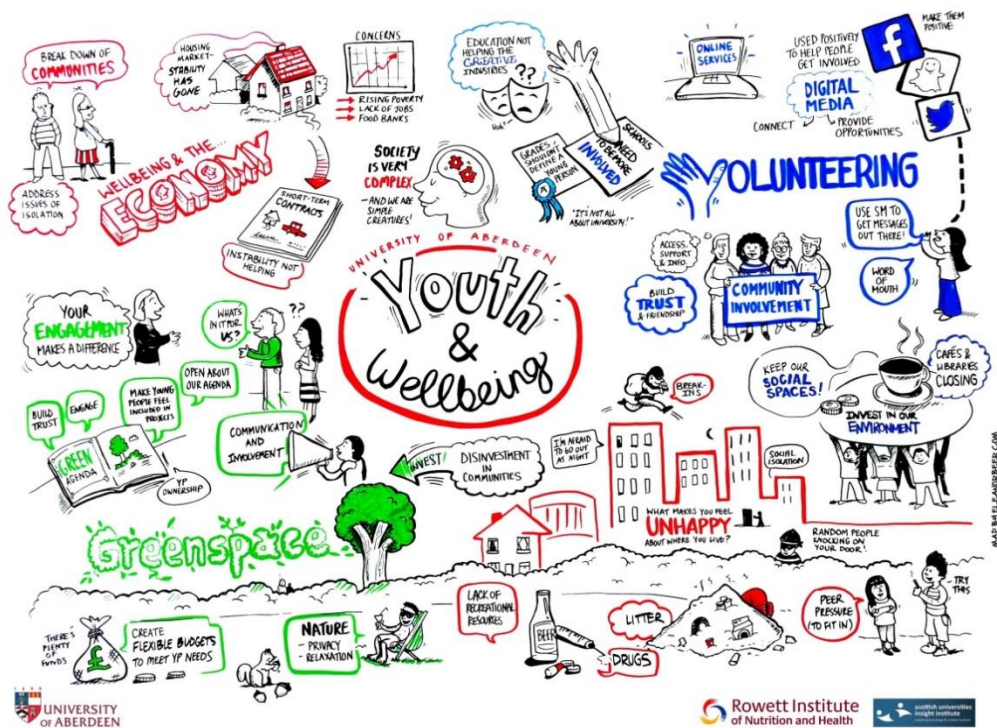
Figure 4 Visual representation of discussions that occurred between researchers from the University of Aberdeen, SHMU volunteer groups and members of the public at Hazelhead Park (August 2014)