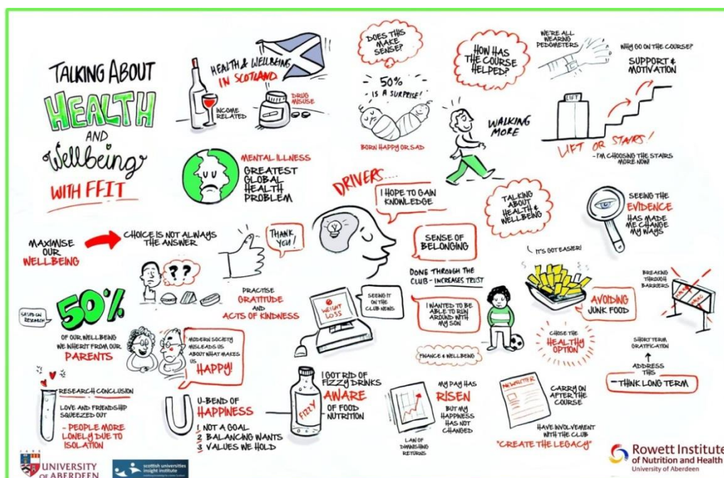
Figure 3. Visual representation map of the discussion carried on at Aberdeen Football Fans in Training event. June 2014 (session 2)